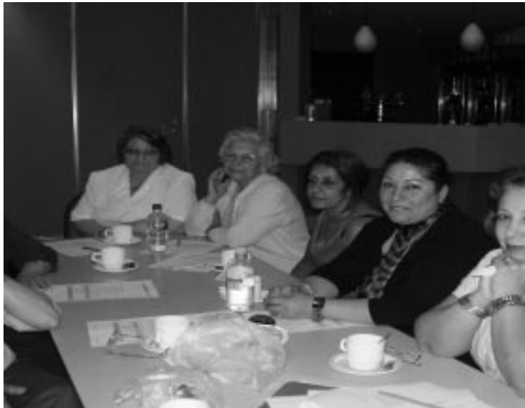
Participants at the most recent network workshop

The Representative Committee will be made up of one representative per housing association. Associations are encouraged to have deputies as well as the official delegate. Committee meetings will be